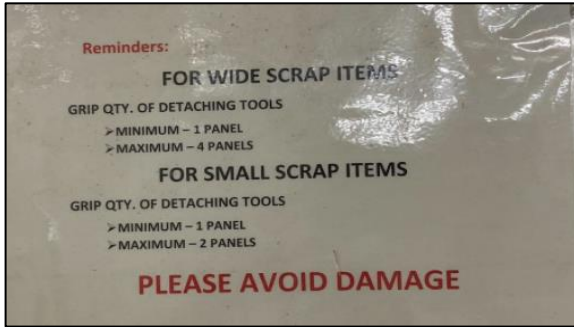
POST SIGNAGE AT DIE-CUT 3